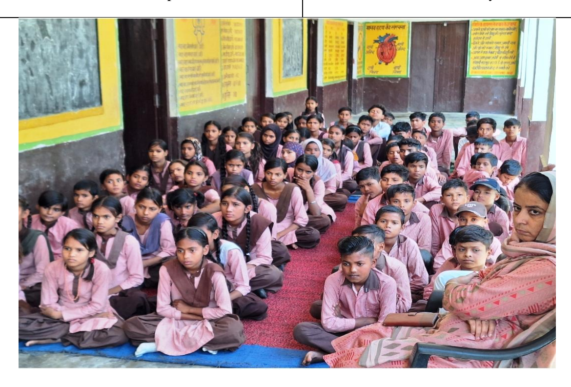
Education Camp at Village Bhatiana, District Hapur