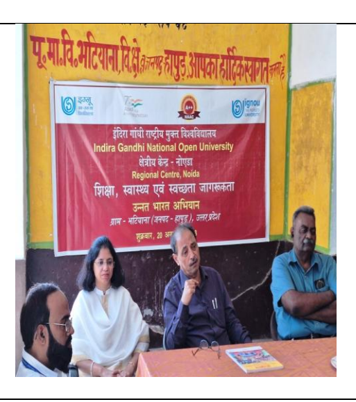
Regional Director addressing the villagers during Education Camp