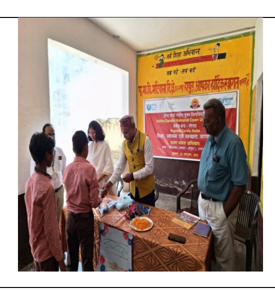
Educational awareness and distribution of stationary