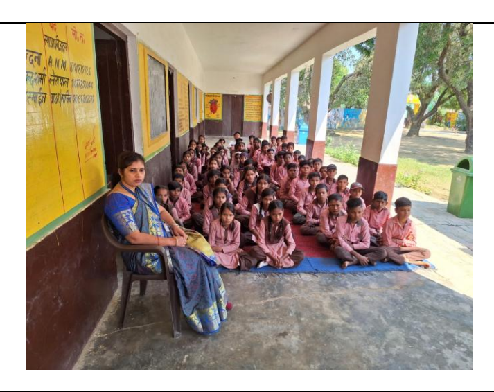
Vigilance Awareness Camp at Adopted Village Bhatiana